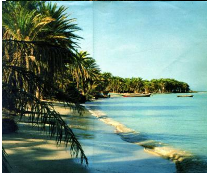
ساحل الخوخة - الحديدة